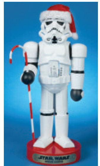
Left: Moose mugs, as seen in National Lampoon's Christmas Vacation are a popular item available at through Retrofestive.ca. Right: Rest assured, this Star Wars Imperial Stormtrooper will crack nuts better than the Rebel Alliance.

Television's Dragon's Den accompanied by an antique fire truck from Chippawa that was used in A Christmas Story.